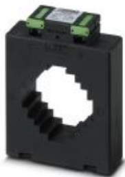
Window-type current transformer, 1000 A AC primary current; 5 A AC secondary current; accuracy class 1; 10 VA rated power

Please be informed that the data shown in this PDF Document is generated from our Online Catalog. Please find the complete data in the user's documentation. Our General Terms of Use for Downloads are valid ( http://phoenixcontact.com/download )