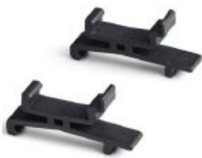
Adapter for mounting on DIN rails.

Please be informed that the data shown in this PDF Document is generated from our Online Catalog. Please find the complete data in the user's documentation. Our General Terms of Use for Downloads are valid ( http://phoenixcontact.com/download )