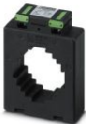
Window-type current transformer, 500 A AC primary current; 5 A AC secondary current; accuracy class 1; 5 VA rated power

Please be informed that the data shown in this PDF Document is generated from our Online Catalog. Please find the complete data in the user's documentation. Our General Terms of Use for Downloads are valid ( http://phoenixcontact.com/download )