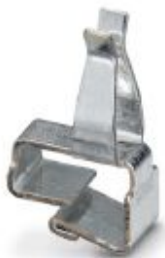
DIN rail housing, FE contact, width: 5 mm, height: 15.25 mm, depth: 9.5 mm, color: silver

Please be informed that the data shown in this PDF Document is generated from our Online Catalog. Please find the complete data in the user's documentation. Our General Terms of Use for Downloads are valid ( http://phoenixcontact.com/download )