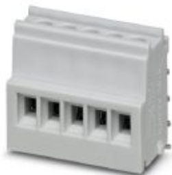
PCB terminal block, pitch: 3.5 mm, number of positions: 5, color: light gray, Pin layout: Linear pinning, Solder pin [P]: 3 mm. Article with lateral pin exit

Please be informed that the data shown in this PDF Document is generated from our Online Catalog. Please find the complete data in the user's documentation. Our General Terms of Use for Downloads are valid ( http://phoenixcontact.com/download )