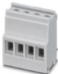
PCB terminal block, pitch: 3.5 mm, number of positions: 4, color: light gray, Pin layout: Linear pinning, Solder pin [P]: 3 mm. Article with lateral pin exit

Please be informed that the data shown in this PDF Document is generated from our Online Catalog. Please find the complete data in the user's documentation. Our General Terms of Use for Downloads are valid ( http://phoenixcontact.com/download )