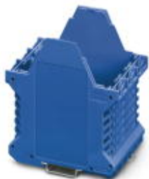
Component housing, length: 99 mm, with vents, Lower part, color: blue, width: 67.5 mm, height: 114.5 mm

Please be informed that the data shown in this PDF Document is generated from our Online Catalog. Please find the complete data in the user's documentation. Our General Terms of Use for Downloads are valid ( http://phoenixcontact.com/download )