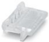
Ejector for COMBICON plug

Components of electronic housing - ME PS-17,5 MC TRANS - 2279842