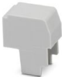
DIN rail housing, Filler plug for unoccupied terminal points, color: light gray (7035)

Please be informed that the data shown in this PDF Document is generated from our Online Catalog. Please find the complete data in the user's documentation. Our General Terms of Use for Downloads are valid ( http://phoenixcontact.com/download )