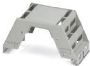
DIN rail housing, Upper housing part for PCB terminal blocks with screw connection, width: 45.2 mm, height: 99 mm, depth: 45.85 mm, color: light gray (7035)

Please be informed that the data shown in this PDF Document is generated from our Online Catalog. Please find the complete data in the user's documentation. Our General Terms of Use for Downloads are valid ( http://phoenixcontact.com/download )