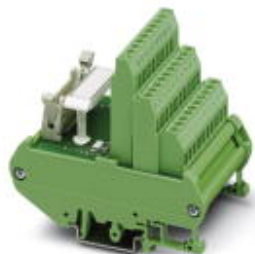
VARIOFACE sensor module, for connecting 8 pnp sensors

Please be informed that the data shown in this PDF Document is generated from our Online Catalog. Please find the complete data in the user's documentation. Our General Terms of Use for Downloads are valid ( http://phoenixcontact.com/download )