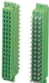
19" socket strip, number of positions: 32, pitch: 0 mm, color: green, contact surface: Tin

Please be informed that the data shown in this PDF Document is generated from our Online Catalog. Please find the complete data in the user's documentation. Our General Terms of Use for Downloads are valid ( http://phoenixcontact.com/download )