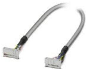
Round cable set; connection 1: IDC/FLK socket strip (1x 14-position); connection 2: IDC/FLK socket strip (1x 14-position); cable length: 0.5 m

Please be informed that the data shown in this PDF Document is generated from our Online Catalog. Please find the complete data in the user's documentation. Our General Terms of Use for Downloads are valid ( http://phoenixcontact.com/download )