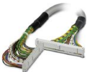
Round cable set; connection 1: IDC/FLK socket strip (1x 50-position); connection 2: IDC/FLK socket strip (1x 50-position); cable length: 2.5 m

Please be informed that the data shown in this PDF Document is generated from our Online Catalog. Please find the complete data in the user's documentation. Our General Terms of Use for Downloads are valid ( http://phoenixcontact.com/download )