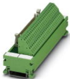
VARIOFACE module, with spring-cage connection and flat-ribbon cable connector, for mounting on NS 35/7.5, 10-pos.

Please be informed that the data shown in this PDF Document is generated from our Online Catalog. Please find the complete data in the user's documentation. Our General Terms of Use for Downloads are valid ( http://phoenixcontact.com/download )