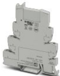
VARIOFACE feed-through terminal block (3-conductor screw connection), for PLC-INTERFACE actuator series

Please be informed that the data shown in this PDF Document is generated from our Online Catalog. Please find the complete data in the user's documentation. Our General Terms of Use for Downloads are valid ( http://phoenixcontact.com/download )