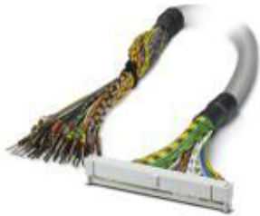
Assembled round cable with a 50-pos. socket strip and an open end, cable length: 2 m

Please be informed that the data shown in this PDF Document is generated from our Online Catalog. Please find the complete data in the user's documentation. Our General Terms of Use for Downloads are valid ( http://phoenixcontact.com/download )