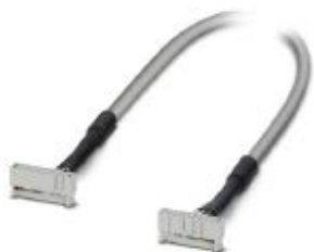
Round cable set; connection 1: IDC/FLK socket strip (1x 16-position); connection 2: IDC/FLK socket strip (1x 16-position); cable length: 8 m

Please be informed that the data shown in this PDF Document is generated from our Online Catalog. Please find the complete data in the user's documentation. Our General Terms of Use for Downloads are valid ( http://phoenixcontact.com/download )