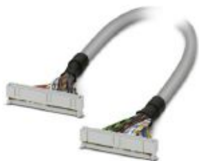
Round cable set; connection 1: IDC/FLK socket strip (1x 34-position); connection 2: IDC/FLK socket strip (1x 34-position); cable length: 3 m

Please be informed that the data shown in this PDF Document is generated from our Online Catalog. Please find the complete data in the user's documentation. Our General Terms of Use for Downloads are valid ( http://phoenixcontact.com/download )