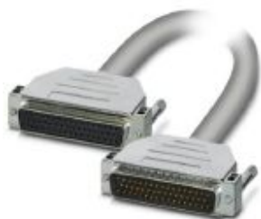
Assembled shielded round cable; connection 1: D-SUB socket strip (1x 50-position); connection 2: D-SUB pin strip (1x 50-position); cable length: 4 m

Please be informed that the data shown in this PDF Document is generated from our Online Catalog. Please find the complete data in the user's documentation. Our General Terms of Use for Downloads are valid ( http://phoenixcontact.com/download )