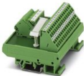
VARIOFACE module, with two equipotential busbars (P1, P2) for potential distribution, for mounting on NS 35/7.5 or NS 32. Module width: 90 mm

Please be informed that the data shown in this PDF Document is generated from our Online Catalog. Please find the complete data in the user's documentation. Our General Terms of Use for Downloads are valid ( http://phoenixcontact.com/download )