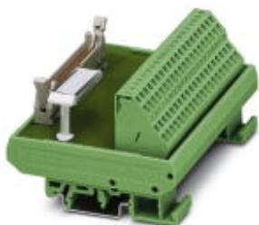
Standard 1:1 FLK module, with spring-cage connection and flat-ribbon cable connector, no. of positions 16

Please be informed that the data shown in this PDF Document is generated from our Online Catalog. Please find the complete data in the user's documentation. Our General Terms of Use for Downloads are valid ( http://phoenixcontact.com/download )