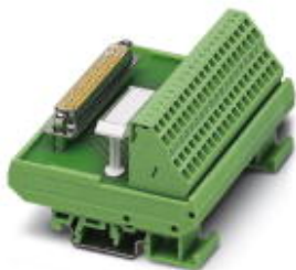
Standard 1:1 D-SUB module, with spring-cage connection and D-SUB pin strip, no. of positions 37

Please be informed that the data shown in this PDF Document is generated from our Online Catalog. Please find the complete data in the user's documentation. Our General Terms of Use for Downloads are valid ( http://phoenixcontact.com/download )