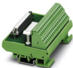
Standard 1:1 D-SUB module, with spring-cage connection and D-SUB socket strip, no. of positions 37

Please be informed that the data shown in this PDF Document is generated from our Online Catalog. Please find the complete data in the user's documentation. Our General Terms of Use for Downloads are valid ( http://phoenixcontact.com/download )