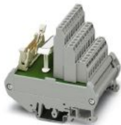
Interface module with 1:1 connection (suitable for Delta V control system)

Please be informed that the data shown in this PDF Document is generated from our Online Catalog. Please find the complete data in the user's documentation. Our General Terms of Use for Downloads are valid ( http://phoenixcontact.com/download )