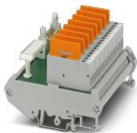
Fuse module (for analog output cards of the Delta V control system)

Please be informed that the data shown in this PDF Document is generated from our Online Catalog. Please find the complete data in the user's documentation. Our General Terms of Use for Downloads are valid ( http://phoenixcontact.com/download )