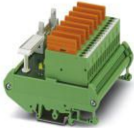
Fuse module with LEDs (for digital input cards of the Delta V control system)

Please be informed that the data shown in this PDF Document is generated from our Online Catalog. Please find the complete data in the user's documentation. Our General Terms of Use for Downloads are valid ( http://phoenixcontact.com/download )