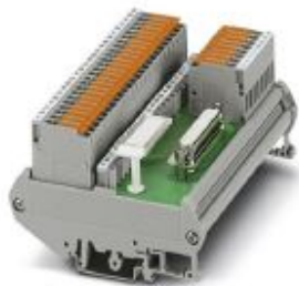
VARIOFACE module for ABB S800 I/O, with knife disconnect terminal blocks and specific marking (+1, B1, C1, +2, B2, C2, ... +8, B8, C8)

Please be informed that the data shown in this PDF Document is generated from our Online Catalog. Please find the complete data in the user's documentation. Our General Terms of Use for Downloads are valid ( http://phoenixcontact.com/download )