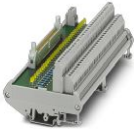
32-channel module with LED and 2-wire connection; common minus potential (for output cards of the Delta V controller)

Please be informed that the data shown in this PDF Document is generated from our Online Catalog. Please find the complete data in the user's documentation. Our General Terms of Use for Downloads are valid ( http://phoenixcontact.com/download )