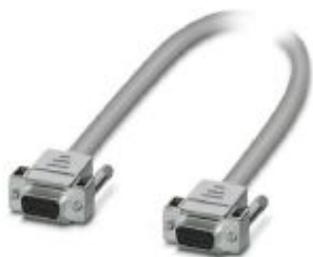
Assembled shielded round cable; connection 1: D-SUB socket strip (1x 9-position); connection 2: D-SUB socket strip (1x 9-position); cable length: 3 m

Please be informed that the data shown in this PDF Document is generated from our Online Catalog. Please find the complete data in the user's documentation. Our General Terms of Use for Downloads are valid ( http://phoenixcontact.com/download )