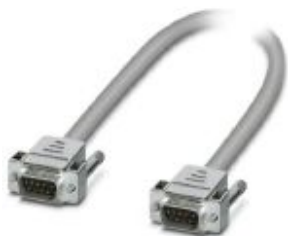
Assembled shielded round cable; connection 1: D-SUB pin strip (1x 9-position); connection 2: D-SUB pin strip (1x 9-position); cable length: 3 m

Please be informed that the data shown in this PDF Document is generated from our Online Catalog. Please find the complete data in the user's documentation. Our General Terms of Use for Downloads are valid ( http://phoenixcontact.com/download )