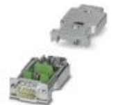
D-SUB plug, 9-pos., pin, axial design with two cable entries, universal type for all systems, pin assignment: 1, 2, 3, 4, 5, 6, 7, 8, 9 to screw connection terminal block

D-SUB bus connector - SUBCON-PLUS-M/AX 9 - 2904467