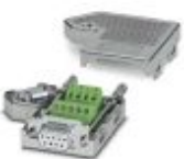
D-SUB plug, 9-pos. female connector, one cable entry < 35°, universal type for all systems, pin assignment: 1, 2, 3, 4, 5, 6, 7, 8, 9 to screw connection terminal block

D-SUB bus connector - SUBCON 9/F-SH - 2761499