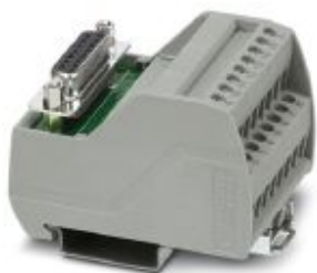
VARIOFACE module, with screw connection and D-SUB 15 socket connector, for mounting on NS 35 rails

Please be informed that the data shown in this PDF Document is generated from our Online Catalog. Please find the complete data in the user's documentation. Our General Terms of Use for Downloads are valid ( http://phoenixcontact.com/download )