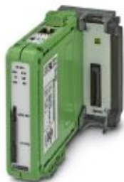
Head station for basic system functionality, no monitoring of PROFIBUS networks

Please be informed that the data shown in this PDF Document is generated from our Online Catalog. Please find the complete data in the user's documentation. Our General Terms of Use for Downloads are valid ( http://phoenixcontact.com/download )