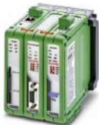
PROFIBUS DP to PROFIBUS PA coupler

Please be informed that the data shown in this PDF Document is generated from our Online Catalog. Please find the complete data in the user's documentation. Our General Terms of Use for Downloads are valid ( http://phoenixcontact.com/download )