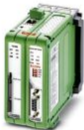
PROFIBUS DP to PROFIBUS PA coupler

Please be informed that the data shown in this PDF Document is generated from our Online Catalog. Please find the complete data in the user's documentation. Our General Terms of Use for Downloads are valid ( http://phoenixcontact.com/download )