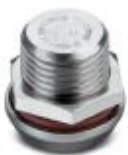
Plug, M20, for FB... enclosure