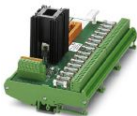
16-channel analog input module with spring-cage connection and redundant voltage supply. Suitable for Yokogawa SAI 143 card.

Please be informed that the data shown in this PDF Document is generated from our Online Catalog. Please find the complete data in the user's documentation. Our General Terms of Use for Downloads are valid ( http://phoenixcontact.com/download )