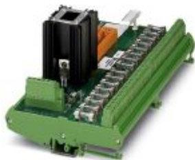
16-channel analog input module with screw connection and redundant voltage supply. Suitable for Yokogawa SAI 143 card.

Please be informed that the data shown in this PDF Document is generated from our Online Catalog. Please find the complete data in the user's documentation. Our General Terms of Use for Downloads are valid ( http://phoenixcontact.com/download )