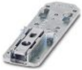
Universal DIN rail adapter

Assembly adapters - UTA 107/30 - 2320089