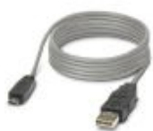
Connecting cable, for connecting the controller to a PC for PC Worx and LOGIC+, USB A to micro USB B, 2 m in length.

Connecting cable - CAB-USB A/MICRO USB B/2,0M - 2701626