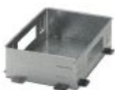
Flush-type box made of galvanized sheet steel for panel mounting.

Mounting material - UP12 21311.000 - 2402854