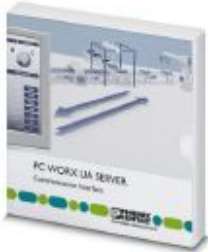
OPC UA server for communication with a maximum of 25 controllers

Please be informed that the data shown in this PDF Document is generated from our Online Catalog. Please find the complete data in the user's documentation. Our General Terms of Use for Downloads are valid ( http://phoenixcontact.com/download )