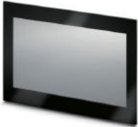
IP65-rated, 15.6-inch, flat-panel LCD monitor with projective capacitive touch screen

Please be informed that the data shown in this PDF Document is generated from our Online Catalog. Please find the complete data in the user's documentation. Our General Terms of Use for Downloads are valid ( http://phoenixcontact.com/download )