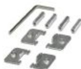
HMI mounting kit for installation on a front plate. The mounting kit includes 6 x mounting brackets, 6 x screw threads, and a hexagonal wrench.

Mounting material - HMI SCB MOUNTING KIT 6 - 2701385