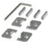
HMI mounting kit for installation on a front plate. The mounting kit includes 6 x mounting brackets, 6 x screw threads, and a hexagonal wrench.

Mounting material - HMI SCB MOUNTING KIT 6 - 2701385