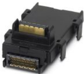
Axioline F bus base module for housing type F

Please be informed that the data shown in this PDF Document is generated from our Online Catalog. Please find the complete data in the user's documentation. Our General Terms of Use for Downloads are valid ( http://phoenixcontact.com/download )