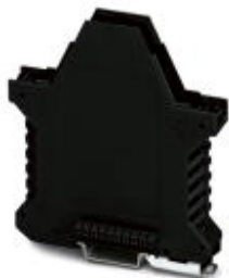
Component housing, length: 99 mm, Lower part, color: black, width: 17.5 mm, height: 114.5 mm

Please be informed that the data shown in this PDF Document is generated from our Online Catalog. Please find the complete data in the user's documentation. Our General Terms of Use for Downloads are valid ( http://phoenixcontact.com/download )