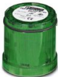
LED blinking light element, 24 V AC/DC, green

Please be informed that the data shown in this PDF Document is generated from our Online Catalog. Please find the complete data in the user's documentation. Our General Terms of Use for Downloads are valid ( http://phoenixcontact.com/download )