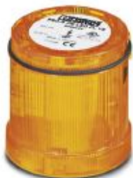
LED flashing beacon element, 24 V DC, double flash, yellow

Please be informed that the data shown in this PDF Document is generated from our Online Catalog. Please find the complete data in the user's documentation. Our General Terms of Use for Downloads are valid ( http://phoenixcontact.com/download )